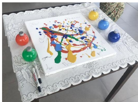
FIGURE 5. The official opening symbolically pouring paint onto a canvas

Based on Figure 5, the main activity of this exhibition is symbolically opened by pouring paint onto a canvas as the official opening of the Architecture Design Exhibition (A.D.E). The variety of colors poured onto the canvas represents the hope that the architecture students of Universitas Bangka Belitung can benefit their environment by bringing their unique colors and characteristics. This way, they can introduce and share architectural knowledge with the community.