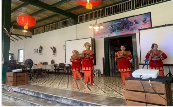
FIGURE 3. Performance by Architecture students to open the exhibition activities

Based on Figure 4, this event also includes an Architecture Seminar presented by professional architects. The goal is for architecture students to learn and develop their knowledge regarding architectural innovations, technology, trends, and the design process. The community also gains insights through the perspective of professionals in the field of architecture. This activity serves as a platform for discussing current architectural issues from various perspectives.