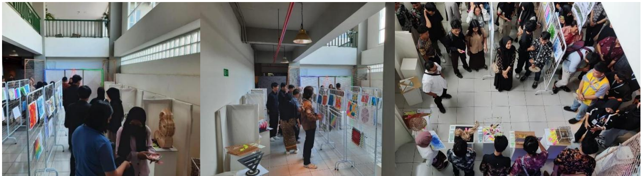
FIGURE 6. Community visiting the Architecture Design Exhibition (A.D.E)

material suppliers, and the community. This exhibition also received positive attention from several local media outlets, which covered and publicized the event (Figure 6).