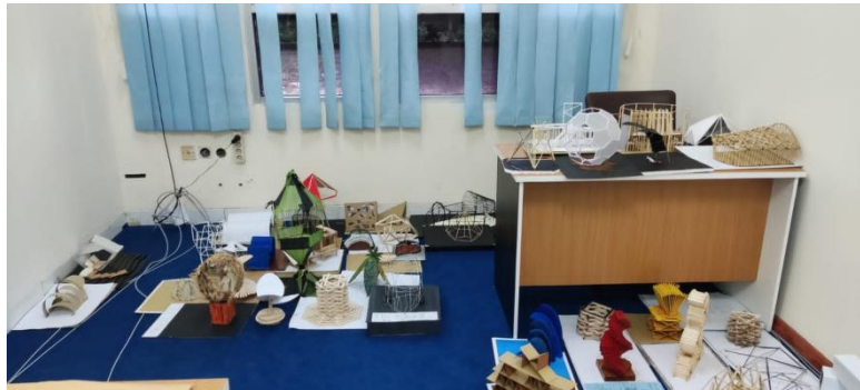
FIGURE 1. Curating Works of Architecture Students