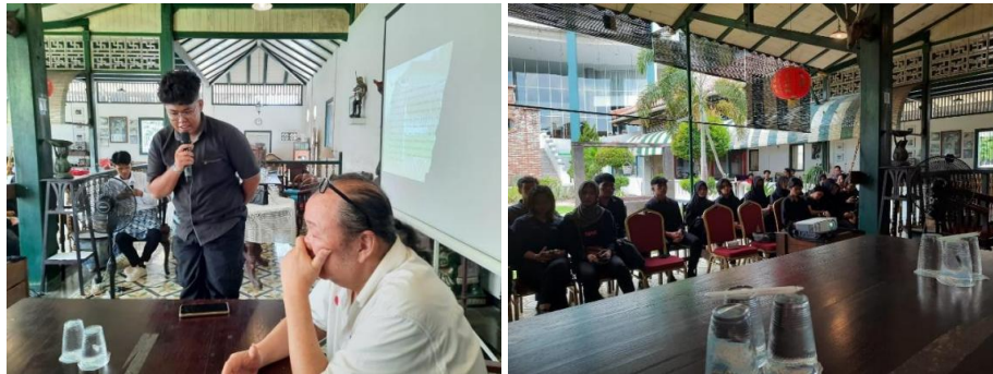
FIGURE 4. Seminar activities at the Architecture Exhibition

Based on Figure 4, this event also includes an Architecture Seminar presented by professional architects. The goal is for architecture students to learn and develop their knowledge regarding architectural innovations, technology, trends, and the design process. The community also gains insights through the perspective of professionals in the field of architecture. This activity serves as a platform for discussing current architectural issues from various perspectives.