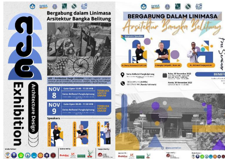
FIGURE 2. Flyer for the Architecture Design Exhibition (A.D.E)