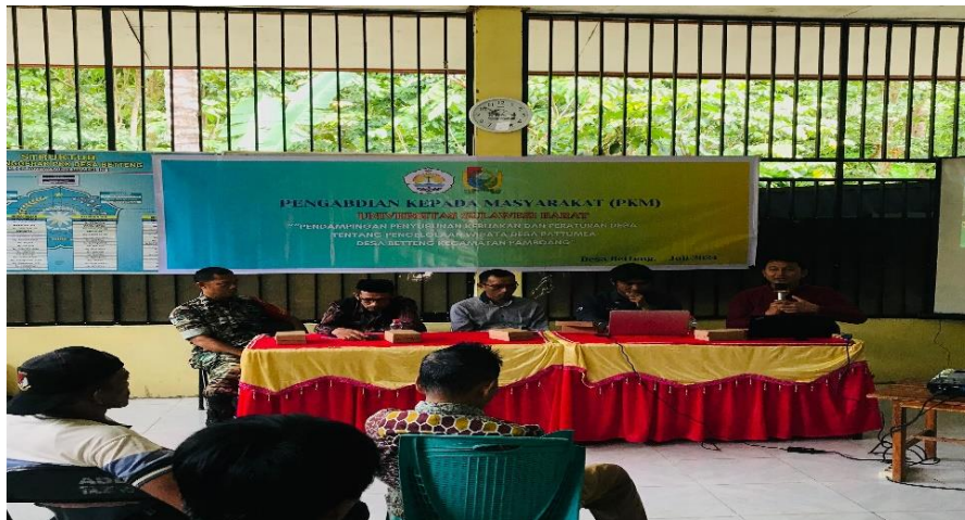
FIGURE 4. Presentation by resource persons related to the preparation of Betteng Tourism Village Regulations

negative impacts of tourism development. And the most important thing is to prepare regulations as a reference in the development of tourism in the village.