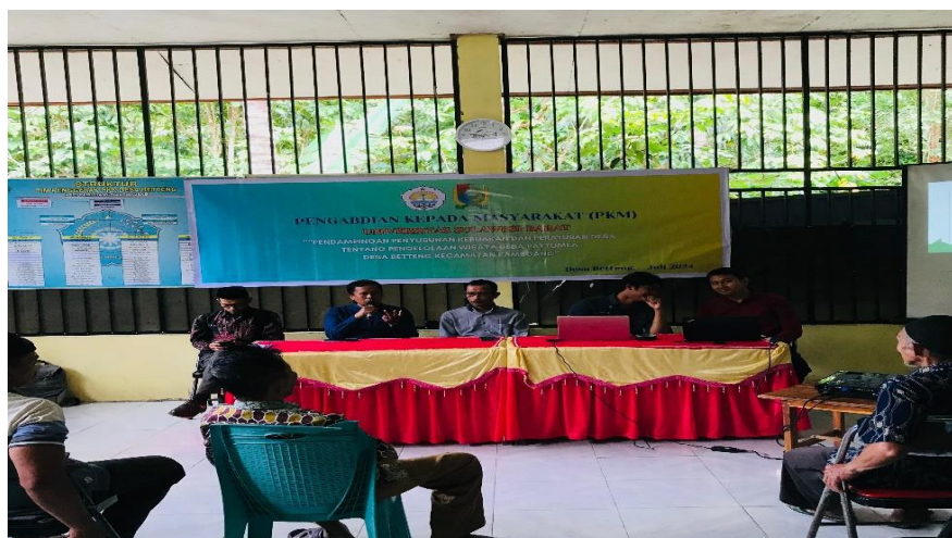
FIGURE 3. Remarks by the Head of Betteng Village in Assistance Activities for the Preparation of Tourism Village Regulations

Betteng Village is one of the villages that has allocated village funds for the development of village tourism from 2020 to 2023, the development of village funds is used to build facilities and infrastructure in Pattumea Hamlet such as roads or tourism access, the construction of swimming pools, halls and villas that can be rented to visitors, the village head also said that access to tourist attractions is still an obstacle because the road is still steep, So that the village government will build alternative roads that are not too steep. So that it does not cause concern for visitors who will enjoy the natural beauty of Pattumea Hill.