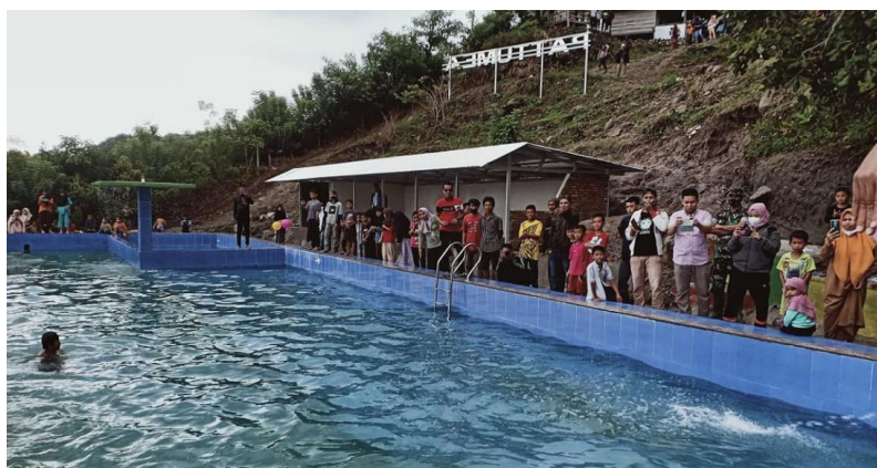
FIGURE 1. Pattumea Bath Tour Betteng Village (Ahmad, 2022)

Betteng Village is one of the villages located in Pamboang District, Majene Regency and is a highland village with beautiful natural scenery. The majority of the population makes a living from farming, producing high-quality well-known products such as pineapple and typical palm sugar. However, it was only in 2019 that infrastructure improvements, especially roads to places with tourism potential, were repaired. In 2020, the village government built Fort Ammanawewang as a tourist attraction, especially historical tourism. Fort Ammanawewang not only tells the history of Indonesia's independence struggle in Majene, but also offers a natural view from above. So that it can be seen from afar the city of Majene and its beautiful sea. Since then, Betteng Village has begun to be known by the local community in West Sulawesi. After that, the village government began to focus on developing tourism potential by asking for input from various stakeholders, including the local government, and ensuring that the development of Betteng village tourism continues to develop with the construction of halls, swimming pools, and homestays. (kemenparekraf, 2022)(Ahmad, 2022)