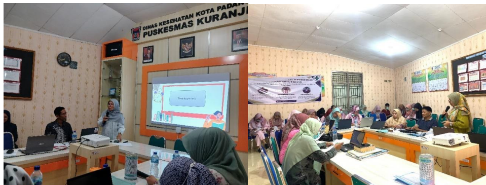
FIGURE 1. The speaker delivers the material

At the beginning of the event, the event was opened by the MC, who acted as MC, who was a PKM member, namely the students, then the PKM team introduced themselves and presented their respective materials, then after that they gave a little explanation about the community service carried out by the PKM Apikes Iris grant team, then the PKM TEAM delivered material to explain the importance of mastering Basic English Skills to health workers and especially in Medical.