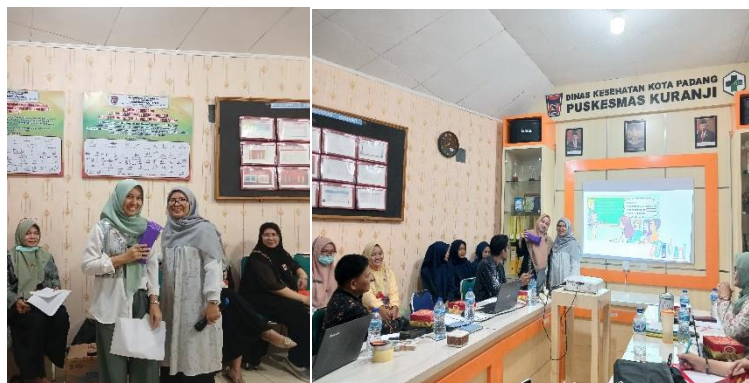
FIGURES 2. Presenters Handing over memorable gifts to participants

Overall, the activity ran smoothly, all participants attended the activity from start to finish. The participants who attended were very enthusiastic and active during the delivery of material and practice.