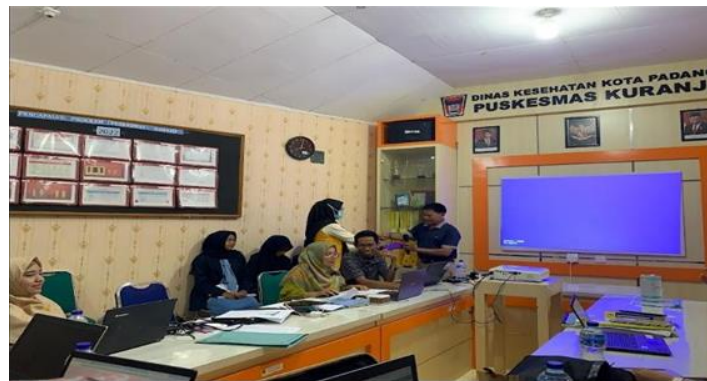
FIGURE 6. The second session gave prizes to participants