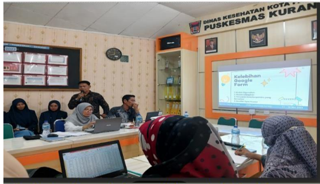
FIGURE 4. The resource person is explaining about Google Forms