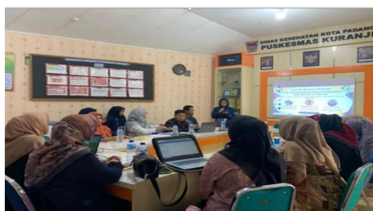
FIGURE 2. Session I The presenter opens the PKM event

In implementing the PKM training or socialization, it was carried out in 2 sessions, where the firstsession was held on Friday, May 17 2024, which was attended by 40 participants from the KuranjiCommunity Health Center and 7 from the Iris Apikes Staff consisting of 4 lecturers and 3 Iris Apikes students. In this PKM activity, the opening was started by the moderator, namely Apikesstudent Iris, then the opening remarks were delivered by the head of the Kuranji Community Health Center. Furthermore, before explaining and explaining Google Forms, a pretest was heldabout Google Forms, after completing the pretest answers, it was continued with the presentationof material by resource persons regarding the use of Google Forms. The materials that have been delivered to the staff of the Kuranji Community Health Center include the understanding of Google forms, the functions and benefits of Google forms, the features provided by Google Forms and their uses, how to create and edit Google forms, how to make questions using the function. from a linear scale, also explains how to save a Google form and distribute or share files that have been created using a link, and share the link on social media such as Whatsapp.