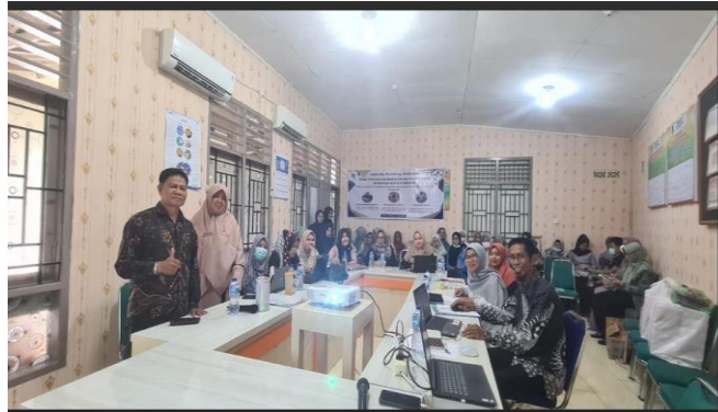
FIGURE 5. Photo together with PKM participants and Apikes Iris staff