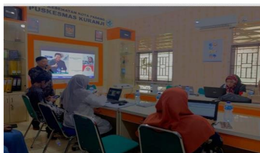
FIGURE 3. Session 1 The resource person introduces himself to the participants