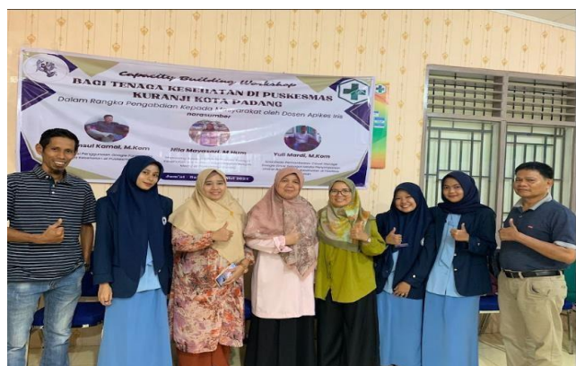
FIGURE 7. Second photo session with the Head of the Kuranji Padang Community Health Center