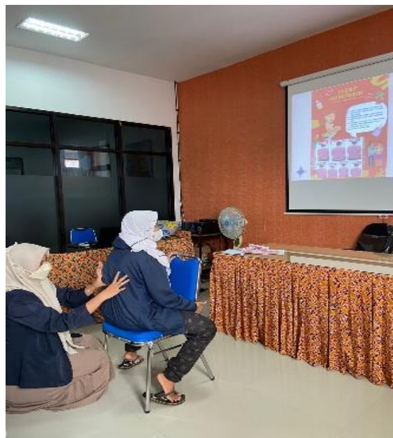
FIGURE 3. Practice massage oxytocin