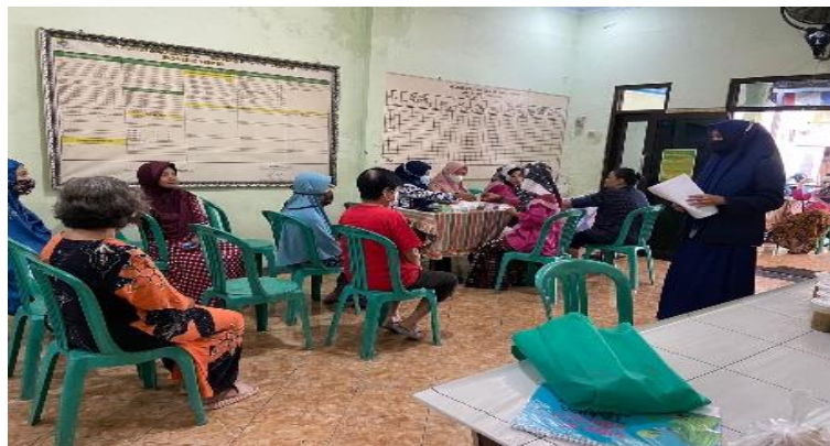
FIGURE 2. Counseling second about exclusive breastfeeding