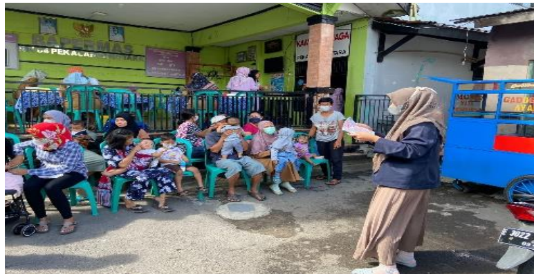
FIGURE 2. Counseling first about exclusive breastfeeding