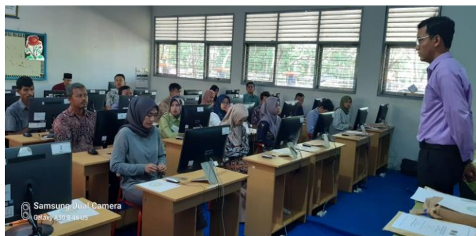
FIGURE 3. Atmosphere Participant Training

Request party village for continue training from participant become reason Why training This designed in a way gradual and continuous. Training this is also as a means of transferring knowledge, and is also a a means of technology transfer obligations of the presenters.