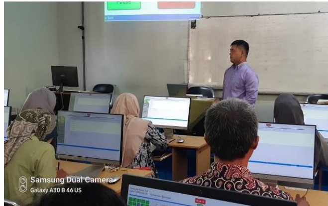
FIGURE 4. Atmosphere Submission of Material