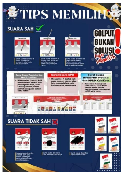
FIGURE 3. Socialization brochure

KPPS in Tonja Village for approval and guidance regarding the location and design of the brochures that I will distribute This activity will take place on Wednesday, January 24, 2024, from 09:00 to 09:30 AM.