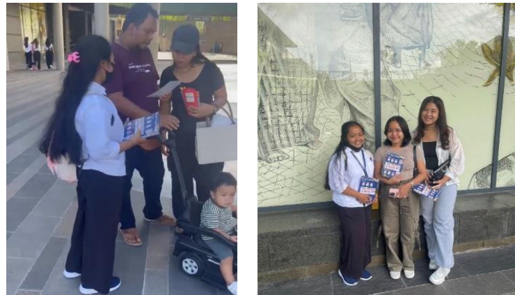
FIGURE 4. Socialization process

From the first idea of making a work program "Socialization as an Effort to Increase Public Awareness of Umun to Realize Peaceful and Integrated Elections", namely because the problem I encountered was that many people were less enthusiastic and afraid to choose leaders who would affect the life of the nation and state, this caused many people to abstain (white group). The results of the implementation of community service activities in Tonja Village, North Denpasar related to the election, namely :