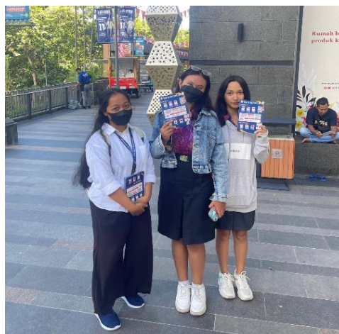
FIGURE 5. Socialization and distribution of brochures to beginners

Overall, in the community service activities carried out, many people are willing to accept and take the time to listen to the socialization and brochures that I do. Especially for beginners as in Figure 5 they are very receptive to what I conveyed. According to them, as voters who do not really understand the meaning of elections and how to vote, this socialization is very useful to increase their insight.