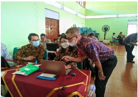
FIGURE 4. Stage of assistance to the publication of scientific work by the team

To make it easier to communicate further progress, the service team provides online consultation facilities in the WhatsApp group that have been agreed upon by the service team and the training participants. In the final stage of mentoring, the lecturer team visited offline in the auditorium of SMA Negeri 6 Semarang to conduct a review and provide important notes for the perfection of the articles that had been written by the participants.