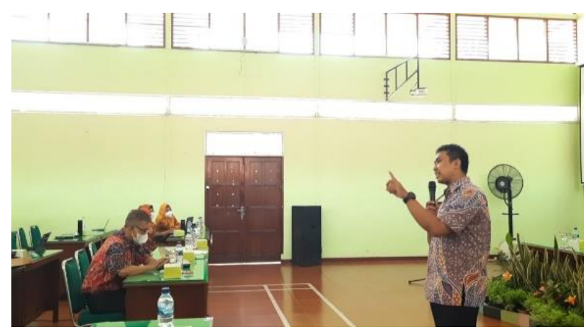
FIGURE 3. Presentation of Material by the Team

Scientific work publication training for teachers at SMA Negeri 6 Semarang was carried out using interactive discussion and demonstration methods. Interactive discussions are carried out so that students can understand directly while the material is being presented. If there is any confusion, participants can ask the material source. Demonstration activities are practiced in making scientific writing based on a journal template, in this case, the Sultan Agung Education Journal template used in delivering the material. This makes the majority of participants active in implementing this service activity. Figure 3 shows that the resource person is delivering training material.