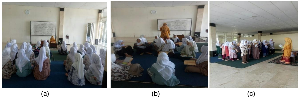
FIGURE 3. Activities (a) material delivery (b) group division (c) direct practice