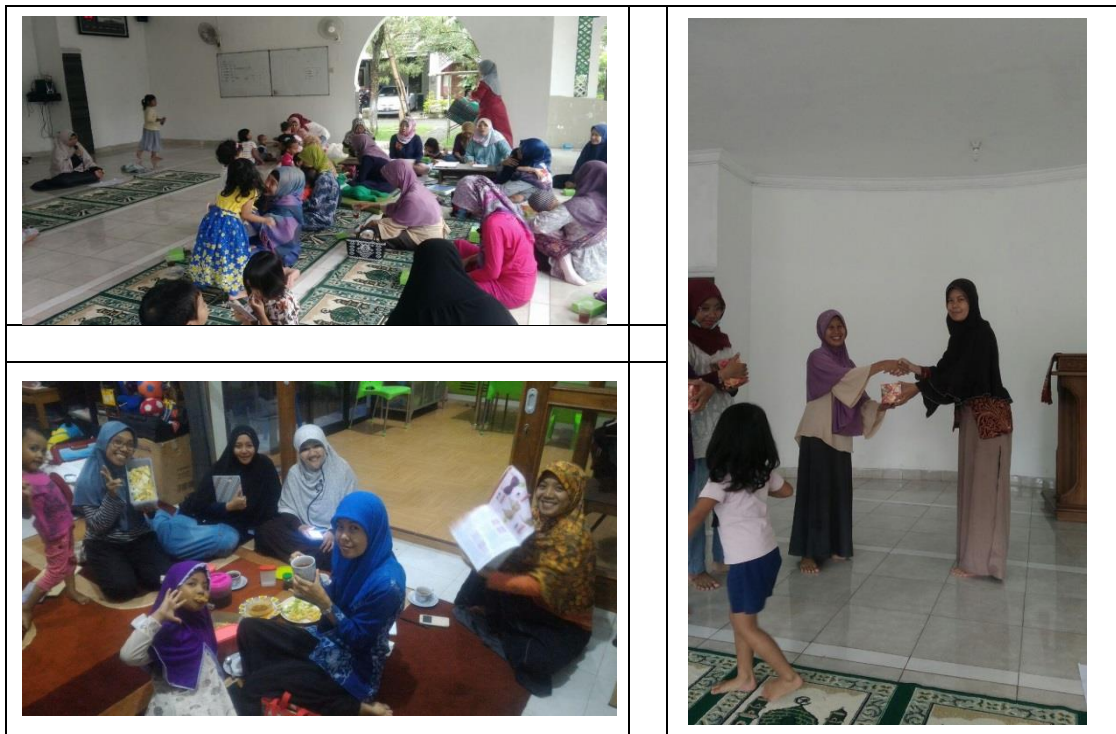
Figure 1. Sharia Financial Literacy Workshop at Puri As-Sakinah Housing

The target of this workshop is BMT Mitra members, namely BMT Sakinah (Puri Sakinah 2 Housing), BMT Al-Anbiya (Pesona Banguntapan Kotagede Housing), and BMT Al-Huda (Graha Banguntapan Housing). The partner BMTs are beginner BMTs that have just been initiated and are managed by recitation mothers in residential areas. So that Islamic financial literacy and specifically about BMT management still need help. Thus, as part of efforts to improve sharia financial literacy in general, a special workshop was held for BMT Mitra members in order to educate sharia contracts in the economy and motivate BMT Mitra members to keep the spirit to do good deeds through the economic sector. Because Islam is a value and a system that only talks about aqidah, but also enters into all lines of life,