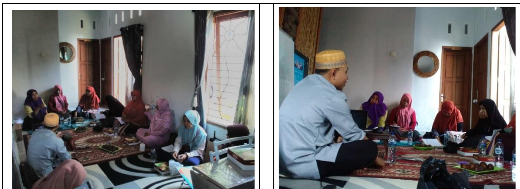
Figure 3. BMT Management Training

The focus of the BMT management material is more on how the steps must be prepared so that the housing BMT can obtain legality and become a legal entity. So that it can expand its market share which is not only focused on housing areas, but can also expand outside housing.