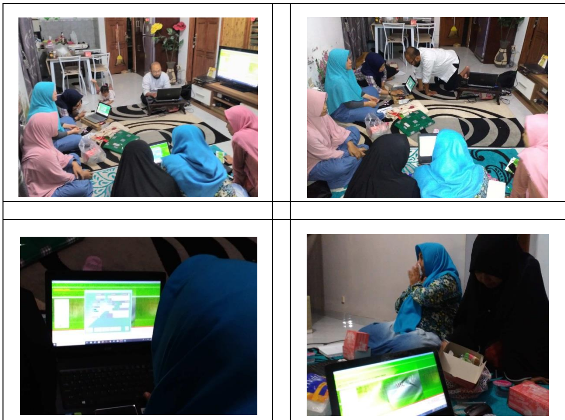
Figure 5. BMT Software practical training

In order to facilitate the operations of BMT Mitra, in this community service there is also a provision of software as well as a direct dissertation training that is directly mentored by the relatively advanced BMT management.