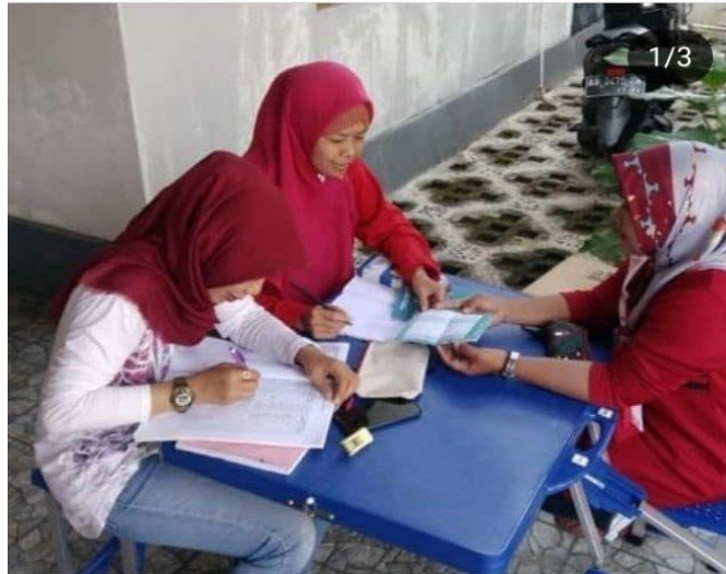
Figure 2. Sharia Transaction Contract Training Process

Materials on sharia transaction contracts were delivered such as wadiah (savings), murabahah (sales and purchase contracts), mudharabah (profit sharing), musyarakah (profit sharing) and ijarah (leasing).