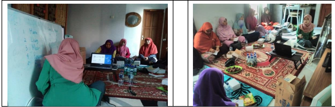
Figure 4. BMT Financial Accounting Training