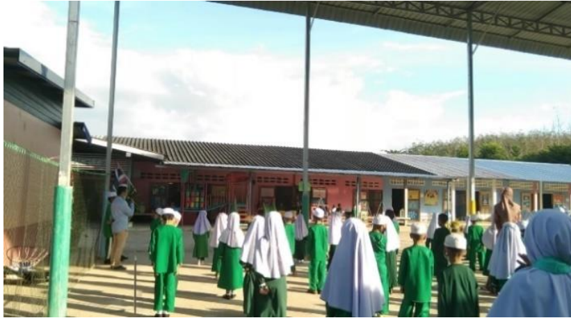
FIGURE 2. Implementation of the Morning Flag Ceremony, which was attended by teachers and students at Anuban Wangmai Sasanasart School