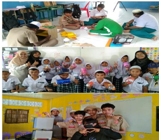
FIGURE 8. Group photo of students and handicrafts made from used goods.

Public speaking skills are no exception. So that later students, after being involved in the community, can easily convey their ideas and opinions both orally and in writing, public speaking skills must be honed starting in the school environment.