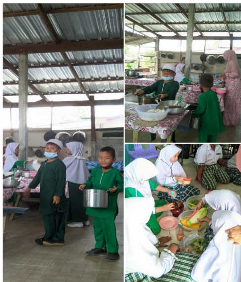
FIGURE 5. After finishing cleaning, students bring lunch that has been provided in the school kitchen to their respective classes

Students, along with other students, carry out activities at several points, such as in front of the class, in classrooms, backyards, and the school kitchen. Students are also taught how to select and sort recyclable and non-recyclable waste. Students are also taught to recycle waste; this aims to increase the ability of students and school residents to deal with waste, especially plastic waste, and be able to reprocess it into new, useful items. (Sulistiyani, 2022) Do not forget that students are taught to wash their hands with soap until they are clean so that there is no dirt or germ attached. Documentation of the break can be seen in Figure 4.