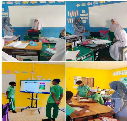
FIGURE 7. Students practice public speaking in front of the class before plunging into the community

Public speaking material was given to Prathom (SD) students in grades 5 and 6 and Mattayom (SMP) students in grades 1, 2, and 3. Judging from the urgency of students at that level, it was time to express opinions properly and correctly. The ability to speak in public is very important for students in carrying out organizational activities, presentations, and giving speeches. (Amali, 2020) Public speaking skills can make it easier to convey ideas, opinions, or thoughts that can change lives for the better. Humans are social creatures who, in everyday life, must interact both with themselves and other people. (Tohani & Lestari, 2022) Documentation when students practice public speaking can be seen in Figure 6.