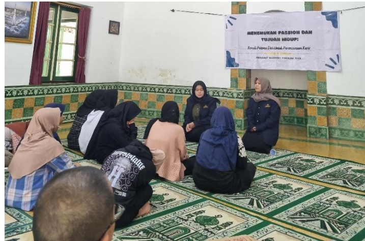
FIGURE 2. Knowledge Sharing Activity