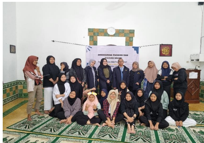
FIGURE 3. photo with the orphanage children after the activity