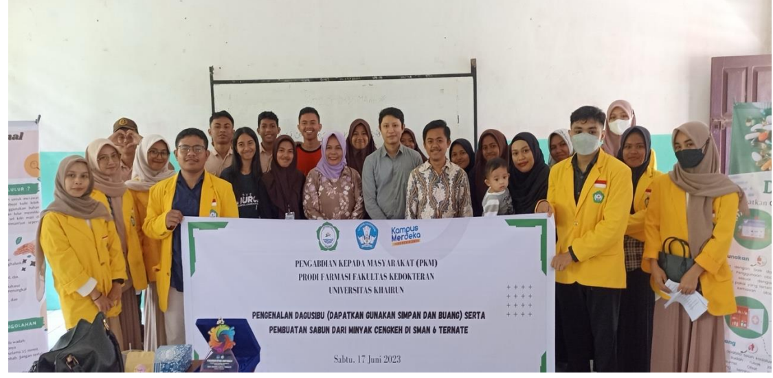
Figure 6. Group photo

After the socialization and education activities end, the information conveyed to participants can be passed back to family, friends and the community around where the participants live. Apart from that, this information can be applied in using medicine properly and correctly. So it can reduce the incidence of drug use errors.