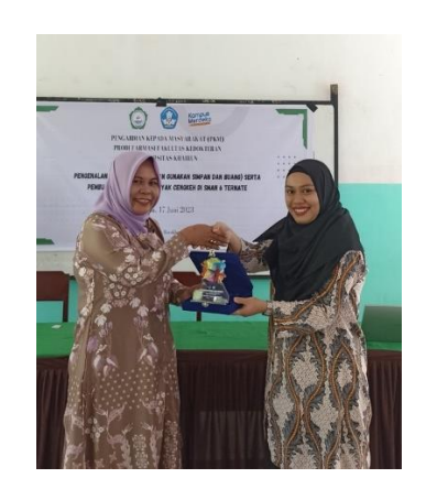
Figure 4. Giving a plaque to Senior High School State 6 of Ternate

with resource persons, teachers, Senior High School State 6 of Ternate students, and Pharmacy students, Khairun University.