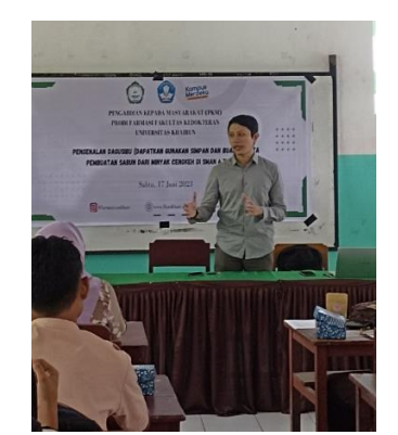
Figure 2. Providing material by the resource person