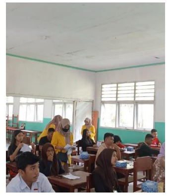
Figure 3. Distribution of leaflets to participants