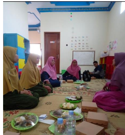
Figure 4. Discussion Group Forum with teachers at Baitul Qur'an Islamic Boarding School Karangbanyu Ngawi