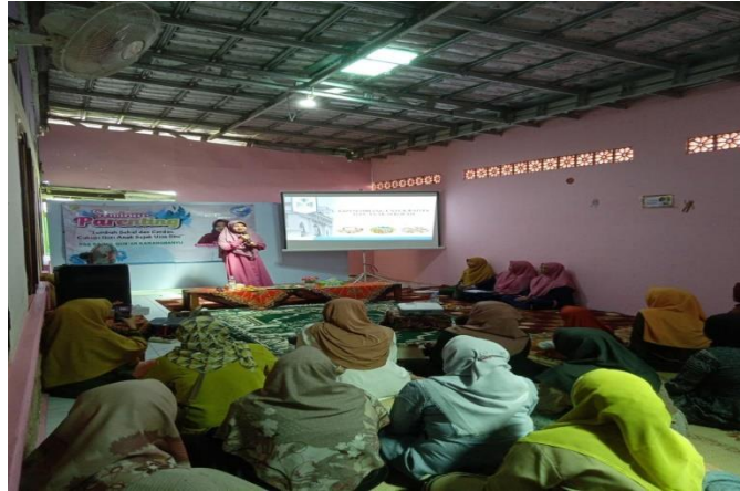
Figure 3. Process of providing education to parents about balanced nutrition

In carrying out this community service, the aim is to provide education to parents regarding balanced nutrition, where the toddler years are a very important period for the continuation of the very rapid growth and development process, namely physical growth and psychomotor, mental, and social development. Psychosocial stimulation must be started early and on time to achieve optimal psychosocial development. To support the physical growth of toddlers, practical guidance on food with balanced nutrition is needed, one of which is by eating a variety of foods that meet nutritional requirements. Nutritional needs for toddlers include energy, protein, fat, carbohydrates, water, vitamins and minerals.