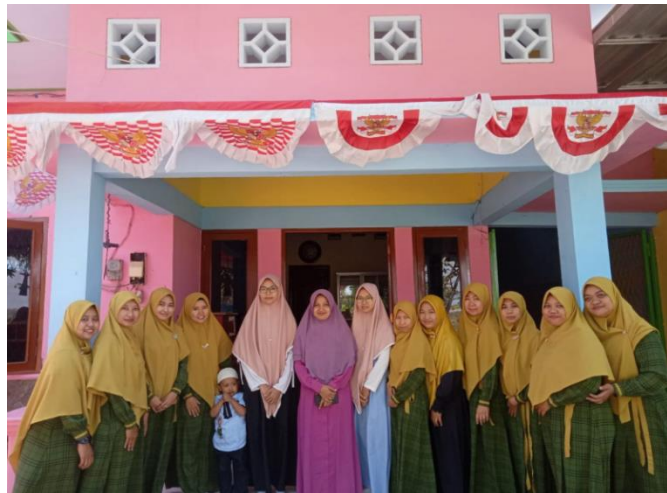
Figure 5. Providing education to parents and taking photos with teachers at Baitul Qur'an Islamic Boarding School Karangbanyu Ngawi