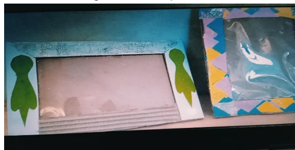
Figure 3. Photo frame crafts