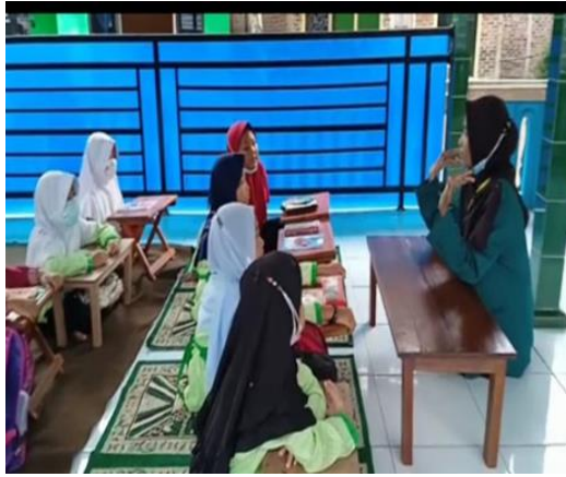
Figure 4. Ricite Alquran