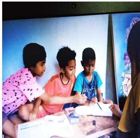
Figure2. Study Group