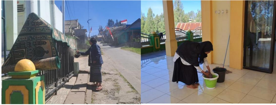
Figure 6. Documentation of the mosque cleaning activity

The community cleanup involving the mosque is carried out to maintain its facilities and comfort the worshippers, enhancing their sense of devotion. It simultaneously aims to attract the mosque's congregation. The cleaning encompasses the mosque's interior and exterior, enhancing its surroundings' beauty and comfort.