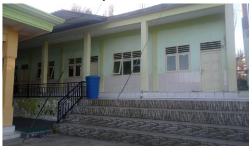
Figure 2. The location of TPQ Riyadlul Jannah is situated beside the Riyadlul Jannah Mosque

TPQ Riyadlul Jannah was established and inaugurated on Wednesday, June 17, 2018, with the assistance of Sheikh Muhammad bin Ismail Zain. This TPQ is situated right beside the Riyadlul Jannah Mosque. TPQ Riyadlul Jannah comprises three classes with an approximate total of 40 students. The teaching staff consists of four individuals. The educational background of the TPQ Riyadlul Jannah students is at the elementary school level.