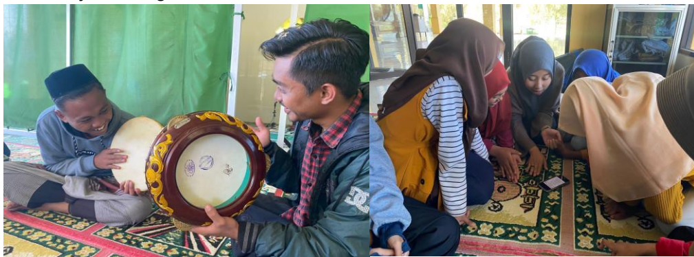
Figure 7. Documentation of the banjari and vocal training

Banjari training focuses on enhancing skills in both vocals and playing the rebana. The activity is attended by residents of all ages, including children, teenagers, and adults from the vicinity. Many children show enthusiasm in participating. Girls learn to sing "shalawat" (praise for the Prophet), while boys learn to play the rebana drum.