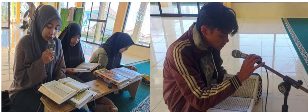
Figure 5. Documentation of the Khotmil Qur'an event

The Khotmil Qur'an activity involves the recitation of Quranic verses from the beginning of a surah to its end, following the sequence in the Quran. This activity is performed collectively, with several individuals participating. Each participant is assigned to recite one or two juz (sections) of the Quran. This activity takes place after the Fajr prayer, adding vibrancy to the mosque's atmosphere during the early morning hours, especially on the revered day of Friday for Muslims.