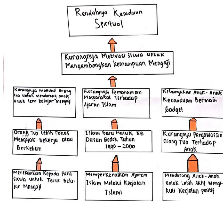
Figure 3. Problem Tree Analysis for Mosque Empowerment

After data collection, the researchers identified several issues, which were subsequently mapped using the problem tree analysis technique (Junjuna, Yudhanti, et al., 2022). The researchers determined the core issues that would be the main focus, then explored the impacts of these issues and identified the primary contributing factors. Following this, appropriate solutions were formulated based on the identified factors contributing to the issues.