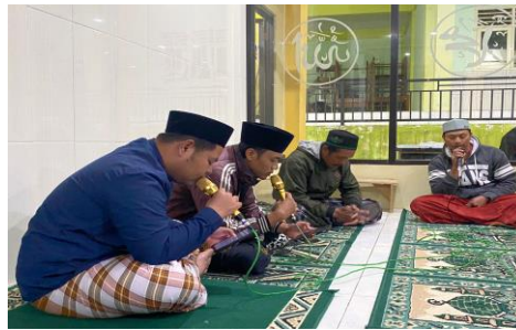
Figure 4. Documentation of the Lailatul Ijtima' event

Lailatul Ijtima' is a religious gathering held during the evening with the aim of bringing together Muslims for various acts of worship, religious discussions, and studies. Activities like recitation of istighotsah, Yasin, and Diba' are conducted during this event.