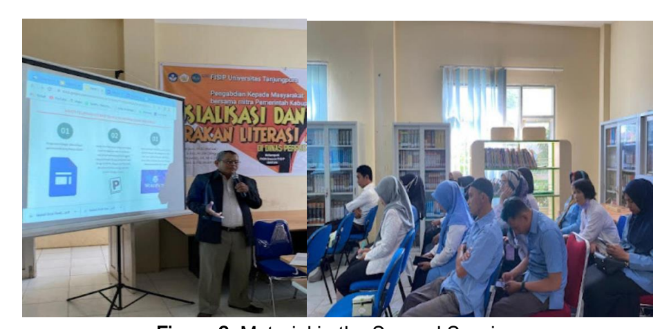
Figure 3. Material in the Second Session

In the second session of this socialization activity, the material presented was related to technology literacy and information and communication. This involved the introduction of Google Sites as a digital literacy support application, the introduction of Paper-pile as a webbased reference management software, and the design of a literacy platform prototype on Google Sites by capturing data from the Google Suites cloud application (Docs, Sheets, Slides, Calendar, Drawing, etc.) -other) integrated into the literacy platform.