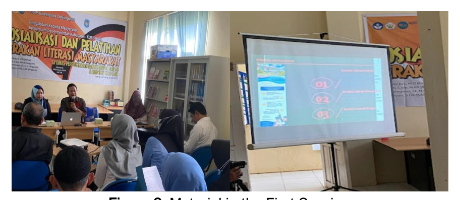
Figure 2. Material in the First Session

innovative and competitive. About this concept, the problem of functional illiteracy and illiteracy, especially in the Kubu Raya area, was recorded by 30,000 illiterate individuals in 2016, 25,000 in 2017, and 14,000 in 2018. The resulting impacts include decreased productivity, increased poverty and crime, susceptibility to fake news, and setbacks in various fields. Therefore, through this socialization activity, it is hoped that the community will be able to understand the importance of literacy.