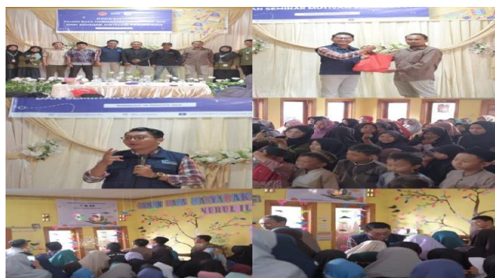
Figure 2. Inauguration of Nurul Ilmi Community Reading Park by the Chairman of the Reading Park Association

On August 6 th 2023, Nurul Ilmi Community Reading Park was inaugurated by the Chairman of the Kuningan Reading Park Association and attended by all Pamupukan village officials and the Bakom hamlet community. The management of Nurul Ilmi Community Reading Park was handed over to the Youth Organization of Bakom hamlet. The socialization activities were enlivened with competitions for children in Early Childhood Education and Elementary School. Based on the results of monitoring and evaluation conducted by the Real Work Lecture team, the Pamupukan village community is very happy and well received the presence of the Nurul Ilmu Community Reading Park. It can be seen that every day, many children come to Nurul Ilmi Community Reading Park to read, chat, play, so Nurul Ilmi Community Reading Park is not quiet. With them reunited, dependence on gadgets can be reduced.