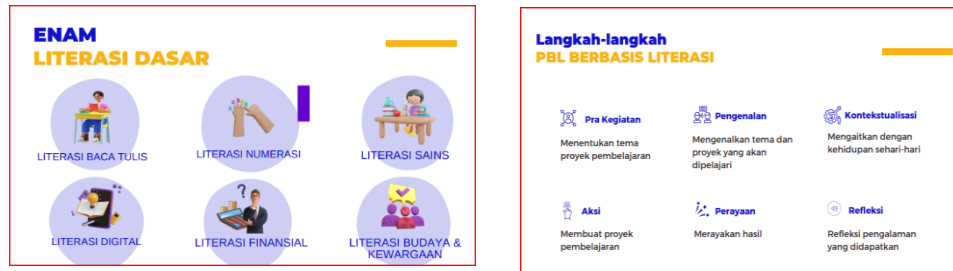
Figure 3. Literacy Materials

The speakers gave examples of its application in the form of student learning projects using the PBL method. The speaker gave an example by playing a video so that participants could see and listen directly. The video shown was an example of a "home diorama" project done by grade 1 elementary school students. The speaker delivered the material deductively, which did not explain the theory first, but gave participants the opportunity to understand the concepts shown in the video. For example, after viewing a video, participants were asked to identify different types of literacy and types of subjects integrated in a learning project that students were working on. Thus, participants can better internalize the material.