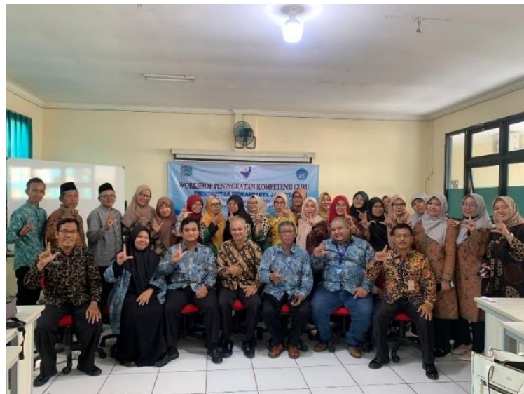
Figure 5. PKM team and participants