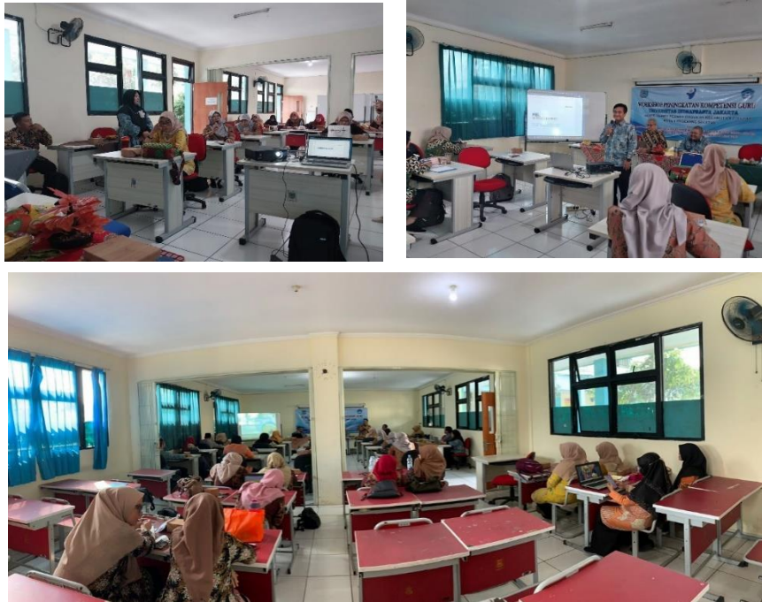
Figure 6. Activities in the class room