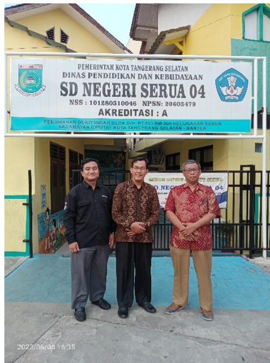
Figure 4. Survey Time