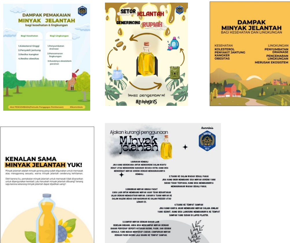
Figure 5. Posters that have been made by cadets related to used cooking oil

Through creative media like this, devotees hope that the message to reduce the use of used cooking oil can also arrive and be easily understood by the surrounding community. The more unique and creative the media for disseminating messages, the faster and more effective the receipt of messages from these media. Especially in the digital era like today, almost all youth depend on social media. Therefore, enliven the action of travelers to reduce the use of used cooking oil, service is mobilized through Instagram social media.