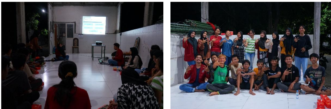
Figure 4. Conducted a sharing session with RW 07 cadets in Klurak Village

Conducted a sharing session with RW 07 cadets in Klurak Village to activate social media, enliven the actions of travelers and reduce the use of used cooking oil. Community service focuses on youth actions that will have an impact that suits their generation. One of them is