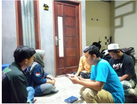
Figure 3. Citizen Counseling as a form of Wandering Action

House-to-house counseling for residents of Klurak Rw 07 village was given to increase residents' understanding of the impact of used cooking oil on health and the environment. By increasing the level of knowledge, it is expected to change the behavior of residents in used cooking oil waste management. At this stage, the devotee explains what are the dangers of using used cooking oil continuously. Devotees encourage creativity and innovation in reducing the use of used cooking oil. They can hold contests, fundraisers, or art events that focus on environmental issues and encourage people to actively participate.