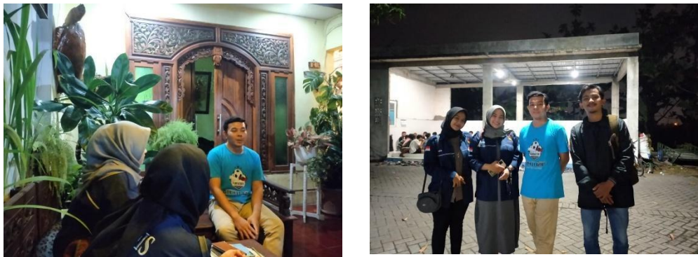
Figure 2. Coordination and interviews with RT in Klurak Village

The youth movement has great potential to create positive changes related to reducing used cooking oil use. With the right commitment, cooperation, and initiative, they can become agents of change that contribute to a healthier environment. As a student of communication science at the same time as a youth, the service needs to realize the role of the youth movement which is very important in reducing the use of used cooking oil through the Wandering Action which was sparked as the main idea in this activity. Here are some steps Action Nomads can take to achieve that goal: