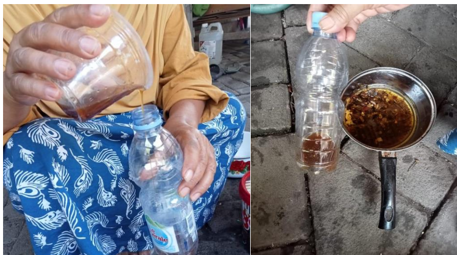
Figure 6. Used cooking oil collection by residents of RW 07 Klurak Village

of Klurak Village posted their poster work on their respective Instagram social media. After the sharing session , there were 5 posters produced by members of RW 07 Klurak Village.