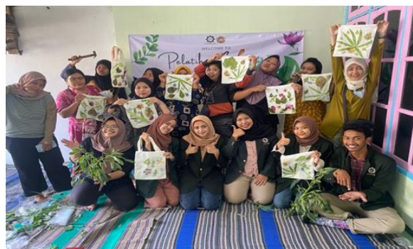
Figure 4. Documentation session with mothers along with the results of eco printing that has been done. The session takes 5 minutes.

The successful implementation of this empowerment activity cannot be separated from the supporting factors of this empowerment activity. Here are some factors supporting the implementation of empowerment activities, including: