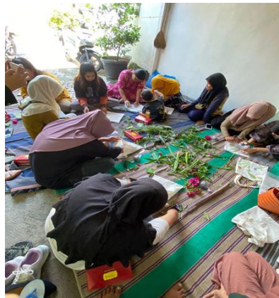
Figure 3. The practice of making eco printing on tote bag media that has been given to participants along with other equipment. Mothers are free to be creative in forming patterns. This manufacturing practice takes 60 minutes.