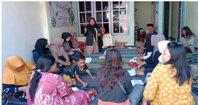
Figure 1. Delivery of material delivered by one of our group members about "Eco printing and Introduction to Digital Marketing". Delivery of material in the form of the early history of ecoprinting, techniques used, business opportunities, and introduction to digital marketing. The material is delivered for 50 minutes.

This training and education activity ran smoothly and was devoted to the mothers of Ex. Gunung Anyar RT.04. The event was attended by 10 people. The training material is in the form of an infographic entitled "Eco printing: Kerajinan Mudah Peluang Usaha".