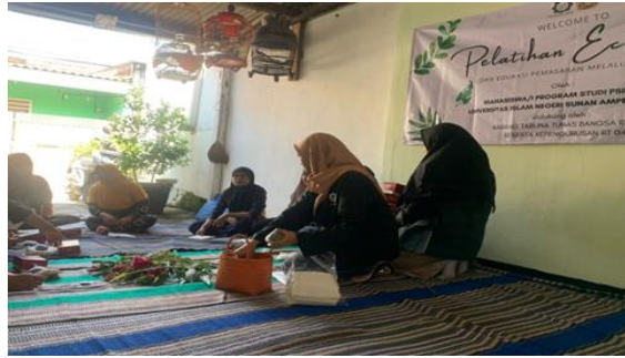
Figure 2. Distribution of equipment in the form of tote bags , stones, plastics, leaves and flowers obtained from the environment around RT.04 before carrying out the practice of making eco printing . All tools and materials distributed become the property of the trainees.