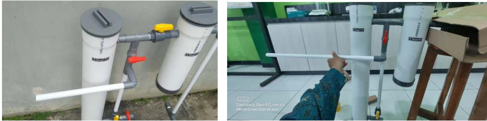
Figure 3. Purchase and installation of water filters and sediment filters