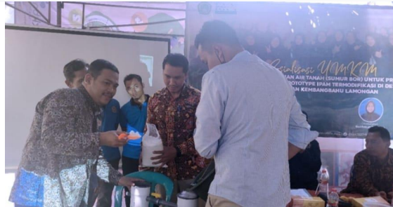
Figure 4. Socialization of Groundwater Treatment with Modified IPA Prototype