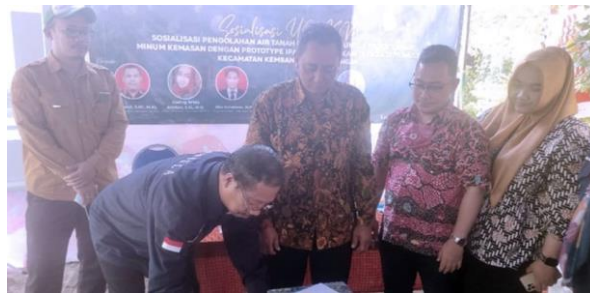
Figure 5. MOU signing