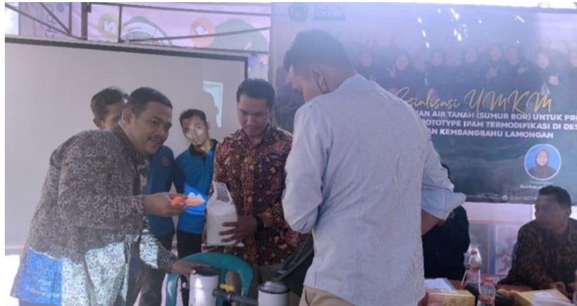
Figure 2. Design of AMDK Donomulyo show to audiences

used to remove dissolved particles above 50 \mu in size and can also reduce concentration of iron and organic matter contained. Activated carbon media is used to absorb odors and colors are used for dissolved metal effects. Cation resin filter media is used to bind the salt content that causes the groundwater to taste brackish. While the series of equipment used in the drinking water treatment unit is shown in figure 1 below (Prasetya dan Saptomo, 2018).