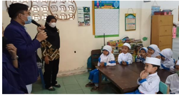
Figure 2. Explanation of Activity Objectives

Before the game activities, students are formed in small groups so as to facilitate playing activities. Documents when students form groups can be seen in Figure 3 below: