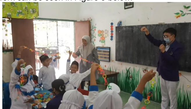
Figure 5. Students can see the results of their work while playing Meronce Lego

All students at the end of the activity can see the results of their work. Documents when students view their work can be seen in Figure 5 below: