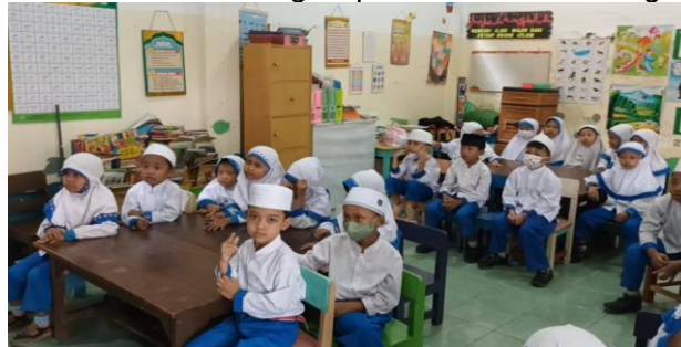
Figure 3. Students are divided into small groups.

Before the game activities, students are formed in small groups so as to facilitate playing activities. Documents when students form groups can be seen in Figure 3 below: