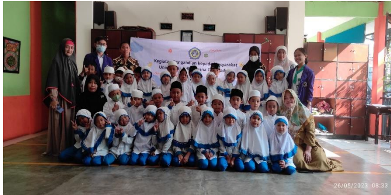
Figure 6. students and teachers picture