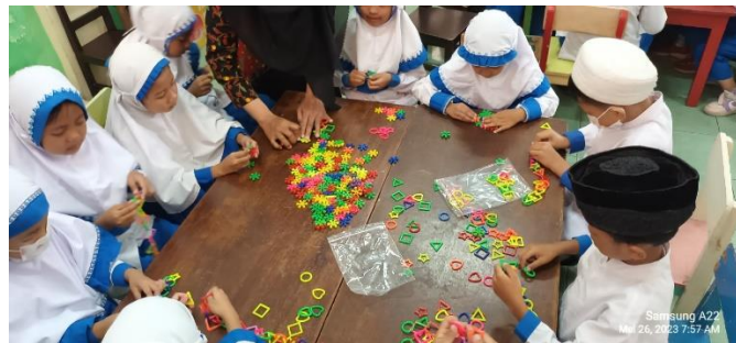
Figure 4. Students playing Meronce Lego

Then the students played the Meronce Lego game happily. Documents when students play can be seen in Figure 4 below: