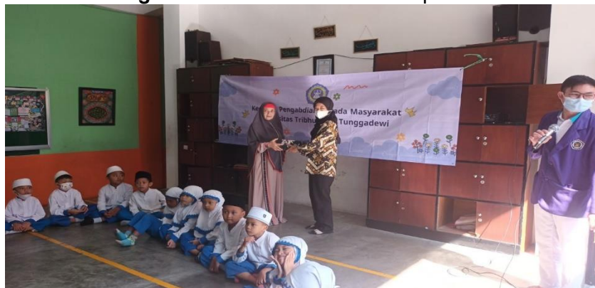
Figure 7. Giving a memento to the school principal

During the activity there are no significant obstacles so that it can run according to the agreement that has been determined with the school and all students can take part in the Lego Meronce game until the allotted time.