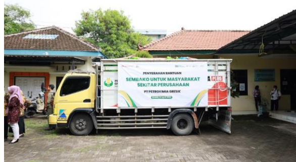
Figure 2. Trucks carrying logistic

The company carried out CSR programs directly by organizing its own social activities or making donations to the community without intermediaries. Delivery via trucks carrying groceries has arrived at the Roomo Village sub-district as shown in Figure 2 below: