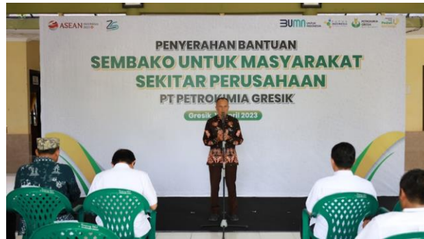
Figure 3. Welcoming speech

obstacles in program implementation (Maryani and Nainggolan, 2019:13) can be seen in Figure 3 below: