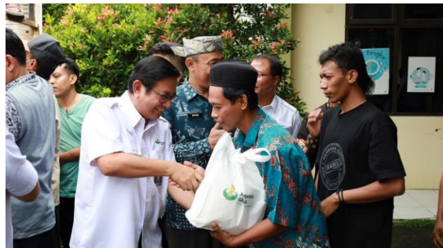
Figure 9. Distribution of groceries

From the previous description, it can be drawn a common thread that many CSR theories focus on 4 main aspects, as revealed by Garriga & Mele (2004:65), namely: (1) meeting objectives that produce long-term profits, (2) using business power in a responsible way, (3) integrating social demands and (4) contributing to a good society by doing what is ethically correct (Budiarti S n.d.). One of the forms of PT Petrokimia Gresik is providing groceries. Documents when the company representative provided the basic necessities can be seen in Figure 9 below: