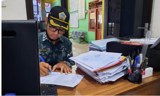
Figure 1. Submission of report

At the early stages, students provided an agenda letter to be signed by the Roomo Village sub-district office, this preparation was carried out so that community empowerment could take place well (Maryani and Nainggolan, 2019:13) can be seen in Figure 1 below: