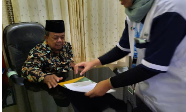
Figure 6. Submission of report

In the implementation of community development, there are several fields or areas that can be targeted in efforts to develop and empower the community. The areas of scope that can be carried out for community development and empowerment usually cover the economic, education, health and socio-cultural sectors (Rahmadani, Raharjo, and Resnawaty 2019). The Karangturi sub-district was also the other target of place for PT.Petrokimia CSR Program. The head of sub-district also signed the official report, which can be seen in Figure 6 below: