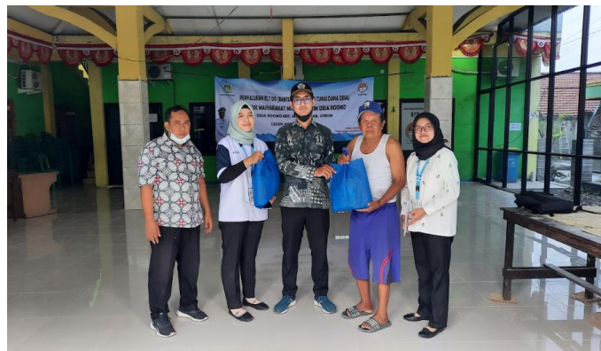
Figure 4. Provision of basic necessities

After the welcome speech, the university students helped to distribute groceries to residents directly, where the recipients have been recorded first before the program is implemented so that residents receive assistance in a fair and equitable manner, can be seen in Figure 4 below: