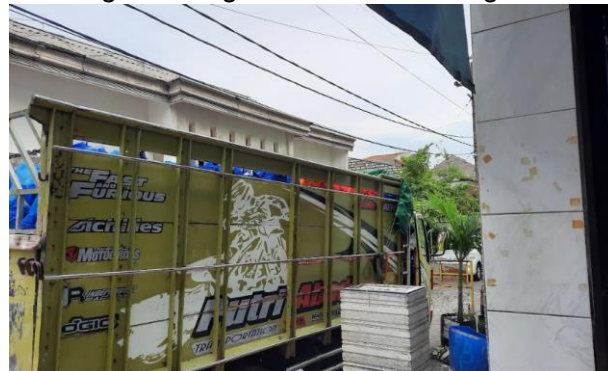
Figure 7. Trucks carrying logistic

Based on figure 6, Richa Meyta Sari submitted reports regarding permits to use the location and carry out the distribution of basic necessities and training to MSMEs which was approved and signed by Mr. Jamal as the head as sub district. Documents when the food-carrying trucks arrived at Karangturi Village can be seen in Figure 7 below: