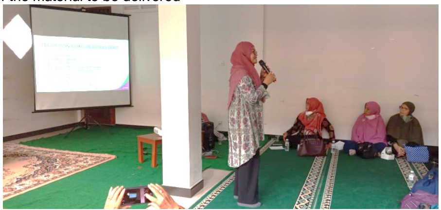
Figure 2. explained about Al-Ab Allughowi's material

Step two is The presenter explained about Al-Ab Allughowi's material, namely about language games. In this case the training explains the material and provides direct simulation examples of the material to be delivered