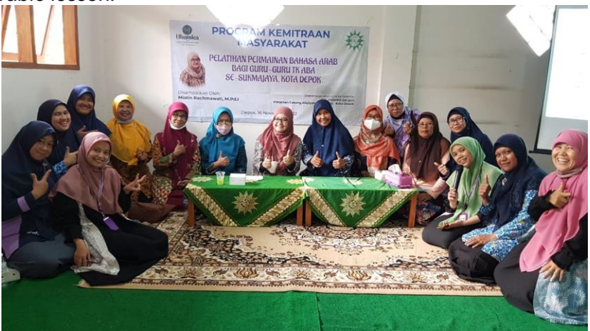
Figure 5. photo with Aisyiyah Bustanul Athfal Kindergarten teachers

Al-Ab Al-Ihugowi training is a game in teaching and learning activities especially in Arabic subjects, this helps Arabic language teachers to be able to always motivate students, especially in a beginner level Arabic lesson.