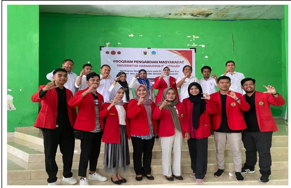
Figure 2. Community service team