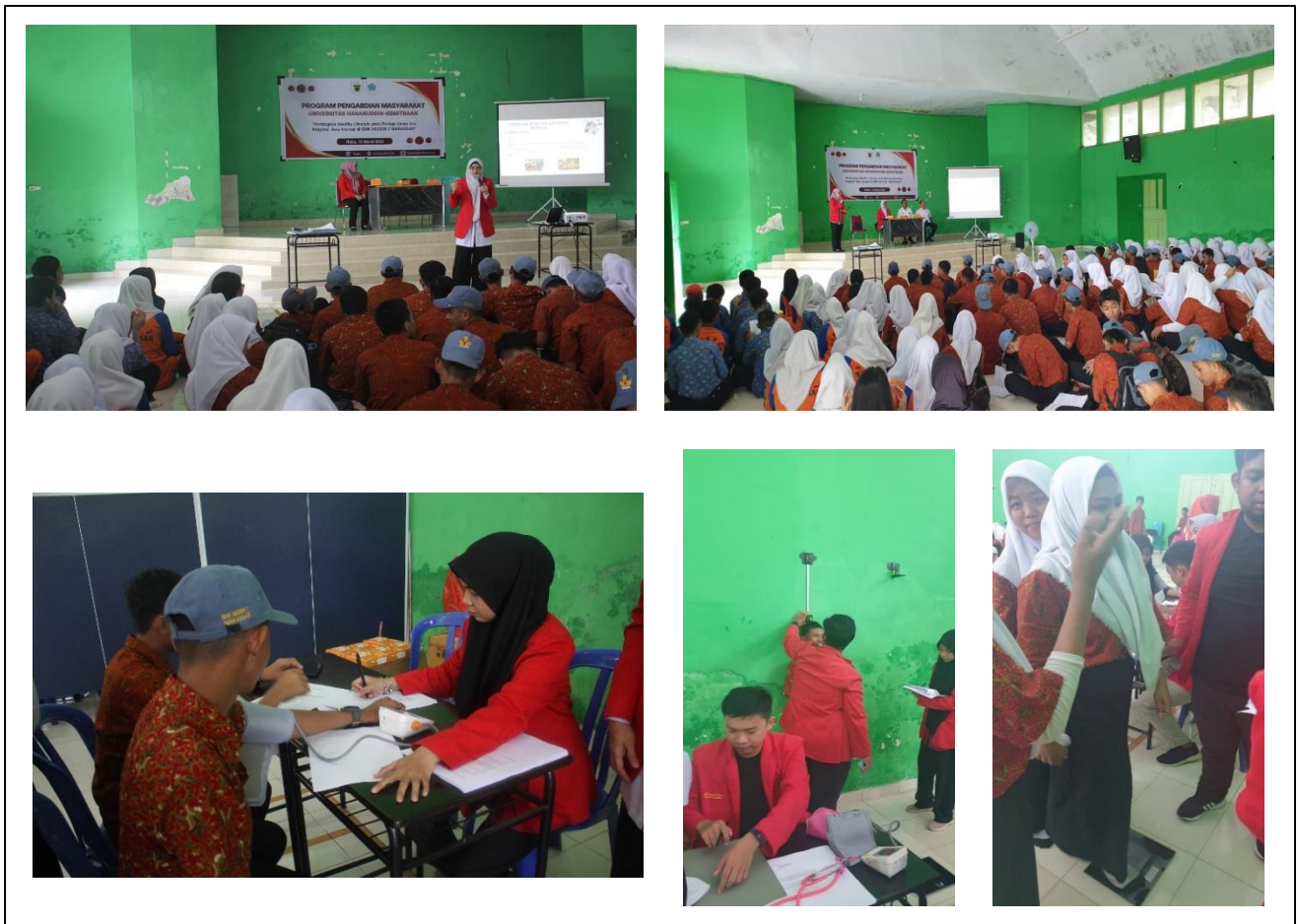
Figure 3. Community service activities