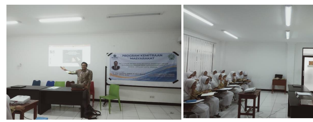
Figure 1. Presentation of material in PKM activities

While carrying out PKM activities at the Muhammadiyah Darul Arqom Islamic Boarding School, Depok, the service team presented training material on Ammiyah Egyptian speaking training to students. The material provided is 1. Formation of work cards ( Fiil Madhi, Mudhore, and Amr ). 2. Transliteration Guidelines. 3. Changes in Speech. 4. Basic Rules. 5. Vocabulary.