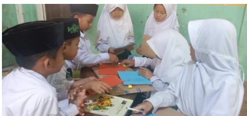
Figure 5. The process of creating a masterpiece

In addition, success is also seen from his work skills not only seen from his reading literacy, starting from the 3rd week the children provide project materials for literacy mading, after that they write the results of what they read in the previous week into origami paper and decorated as skillfully as possible, after decorating and coloring the origami paper is pasted on cardboard that has been adapted to origami paper. In week 4 the children began to attach their work to the mading that had been provided. It is clear that even in terms of skills they managed to improve compared to before.