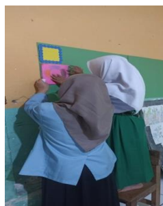
Figure 6. Pasting process