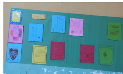
Figure 7. Works

In the program that has been carried out, through various observations periodically that the program has been able to provide added value for the people of Gunung Bakti Rt 04 village, especially MI Al-Barokah. Especially in improving children's abilities and skills towards reading literacy. It is proven that there is a significant increase in reading, so that in the future it can be assisted in its development and can be improved again. In this activity there are still many shortcomings including, books are not available with many there are only a few books