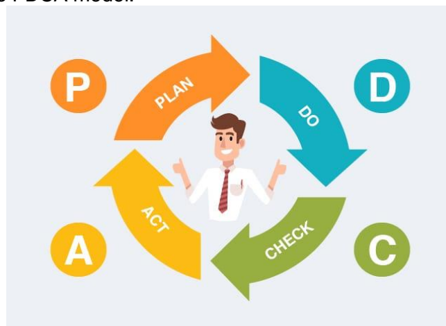
Figure 1. Stages of Research

This community service activity uses Participatory Action Research (PAR) design which is collaborative, practical, and involves others. (Tabroni & Purnamasari, 2022). By using descriptive statistical methods, the author tries to provide a clearer picture of the success rate of the Research program to be run. As for the research conducted, the author collaborated with the manager of the Muttaqien Learning House. The following are the stages carried out in this study using the PDCA model.