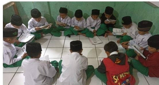
Figure 4. Guided Reading

In addition, success is also seen from his work skills not only seen from his reading literacy, starting from the 3rd week the children provide project materials for literacy mading, after that they write the results of what they read in the previous week into origami paper and decorated as skillfully as possible, after decorating and coloring the origami paper is pasted on cardboard that has been adapted to origami paper. In week 4 the children began to attach their work to the mading that had been provided. It is clear that even in terms of skills they managed to improve compared to before.