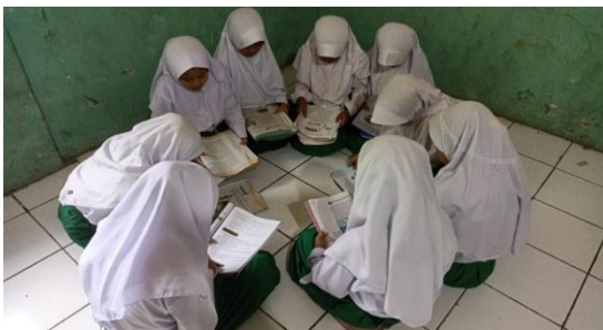
Figure 3. Reading silently