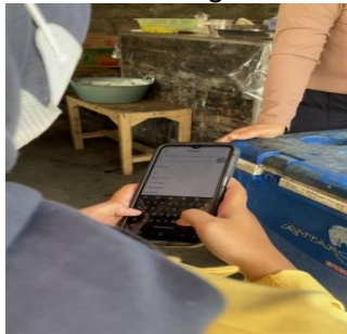
Figure 2 Educating How to Register Your Business Through Google Maps