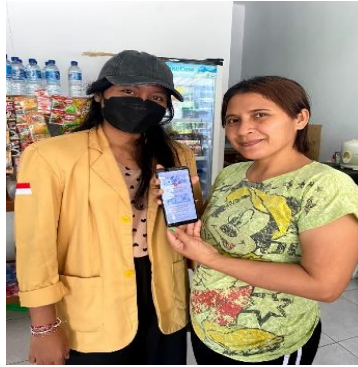
Figure 1 Educating How to Use Google Maps