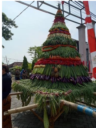
Figure 2. A giant tumpeng

Kirab Gunungan Sedekah Bumi in Munggugianti Village was held on December 18, 2021. Two days before the event, the villagers have prepared a giant tumpeng that is ready to be paraded to the village hall. This year, the tumpeng reaches 2 meters in height with the tip in the form of a pineapple fruit as a symbol of the crown. The process is also quite complicated. It is certain that the villagers work together in making it. Ciputra University team also helped in the making process for the success of the event. Long before the day of the event, the Ciputra University team had communicated and briefed on the activities of the Gunungan Sedekah Bumi