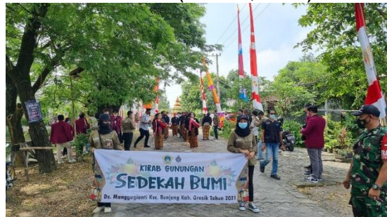
Figure 3. The process of directing tumpeng to the village hall

On the day of the event, tumpeng has been prepared by the locals and placed beside the lake. When all personnel were ready, the procession began. A team from Ciputra University was also