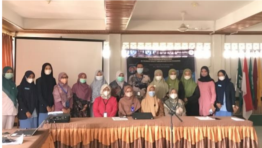
Figure 1. Group photo of the Apikes Iris Lecturer's PKM Team with the Hospital

giving quiz questions related to the material that had been submitted. With this activity it is hoped that it can increase the level of knowledge of health workers at RSU 'Aisyiyah Padang about the importance of reviewing medical records. In the same way as the community health service that was carried out at the Andalas Padang Health Center, based on the results of an evaluation of the activities carried out by the medical record officers, they obtained some new information regarding the completeness of the contents of the medical record (Nasution, 2020). At the end of the session a group photo was taken. The following is the documentation of PKM activities: