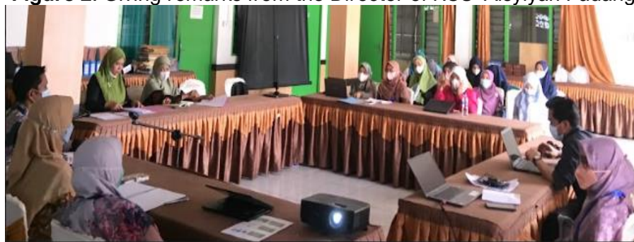
Figure 3. Speeches from Apikes Iris