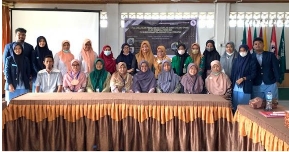
Figure 7. Group photo at the closing of the activity