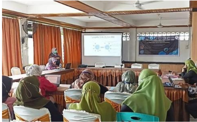
Figure 4. Slide presentation explaining the material