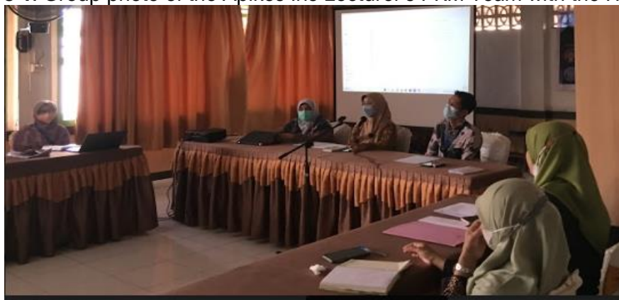
Figure 2. Giving remarks from the Director of RSU 'Aisyiyah Padang