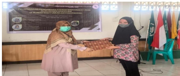
Figure 6. Giving Prizes for Second Highest Score Quiz Scores