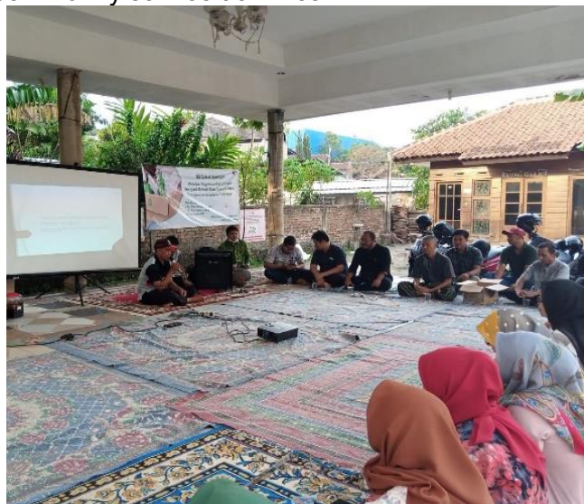
Figure 3. Discussion of waste bank-based inorganic waste management

Some of the advantages found in Pasir Biru Village, Cibiru District, Bandung City are that it has optimal potential to develop inorganic waste management. Furthermore, from the results of the preliminary study, the community service team then made a design of empowerment activities that could be carried out in order to improve the quality of the community in Pasir Biru Village, Cibiru District, Bandung City by utilizing inorganic waste management. Some of the activities carried out are educating the public about inorganic waste management. The next stage is to provide assistance and monitoring of the implemented programs. This means that at this stage the service team provides assistance to the community in Pasir Biru Village, Cibiru District, Bandung City to overcome obstacles found in the process of community service activities.