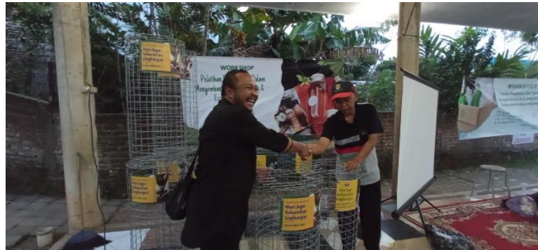
Figure 2. Cooperation in the management of inorganic waste with the community

some of which were the limited understanding of the surrounding community, lack of professional staff to become waste bank managers, as well as inadequate facilities and infrastructure.