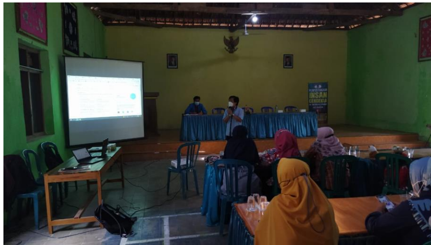
Figure 2. Training related to the photo editing process

The next material is about photo editing. Photo editing skills are very important to have if you want to compose online advertisements. We use Canva software as photo editing software. Canva was chosen because the features it has are quite complete and simple enough for the photo editing process.