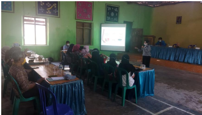
Figure 1. Briefing on copywriting

In the implementation of the training, we did not discuss in detail about the four formulas, but we went straight to the copywriting example. By providing examples, it is hoped that it will make it easier for trainees to compose copywriting.