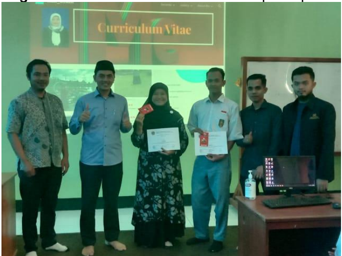
Figure 2. Appreciation to the best website builders