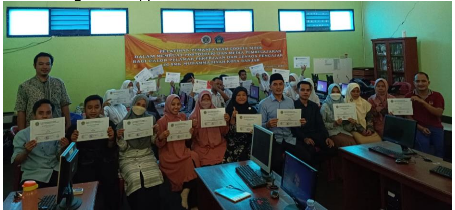
Figure 3. Trainees get a certificate