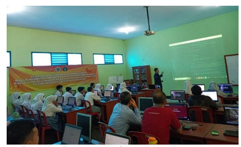
Figure 1. Presentation of material to all participants