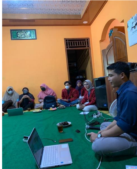
Figure 4. Workshop on Hydroponic