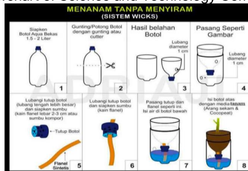
Figure 2. Simple Hydroponic Wicks System Method (Natalia et al., 2020)