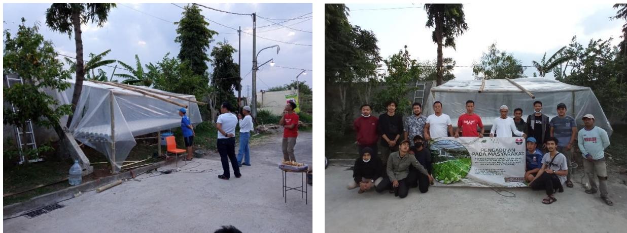
Figure 4. Monitoring activities for community service programs

Based on the description above, it can be seen that hydroponic and aquaponic training for youth groups can be an option for the development of the community's creative economy. This is in line with Mardina (2019) who said that the hydroponic method is a promising method of farming for now, given the increasingly limited condition of agricultural land and the high price of land. Therefore, the hydroponic method can be used by people who only have a limited land area, so they can still be productive (Resh, 2012; Roidah, 2015).