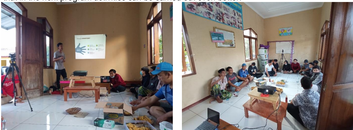
Figure 3. Activities for presenting material about hydroponics

The seventh stage is monitoring, this is done to see how the community can take advantage of the materials and practices that have been provided by the community service team. The last stage is evaluating, this is done in order to reflect on the implementation of community service programs that have been carried out. In addition, this is also intended as input for the community service team so that in the next program activities can be carried out even better.