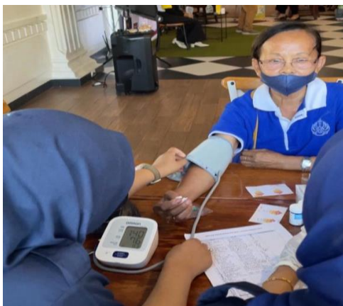
Figure 6. Blood Pressure Measurement

myths and facts about hypertension and the prevention and control of hypertension in the household.