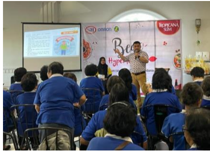
Figure 2. Material Presentation Session