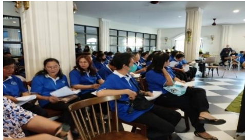
Figure 3. Discussion Session

Knowledge enhancement activities are led directly by experts from the medical faculty. Next, questions were asked to the participants. The enthusiasm of the participants made this implementation longer than the originally planned implementation time.