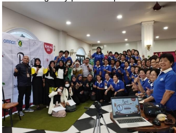
Figure 4. Group photo of participants, expert and students

Knowledge enhancement activities are led directly by experts from the medical faculty. Next, questions were asked to the participants. The enthusiasm of the participants made this implementation longer than the originally planned implementation time.