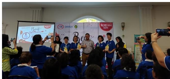
Figure 5. Evaluation Activities

In the evaluation activities are given in the form of interactive questions accompanied by discussion and question-answer from the expert to the participants. This activity was welcomed by the participants because of the door prizes from the sponsors. The enthusiasm of the participants was evident from the large number of participants who wanted to discuss