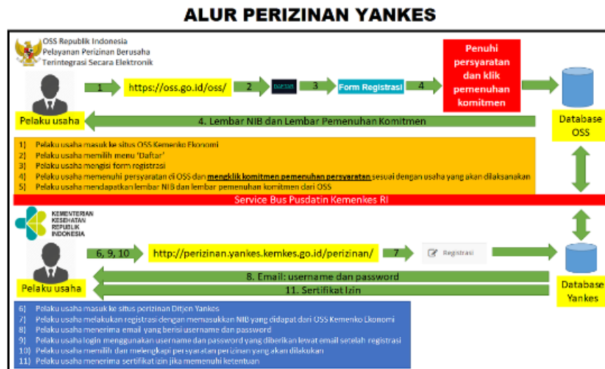
Figure 2. Health Service Licensing Procedures (perizinan.yankes.kemkes.go.id)

The progress of the establishment process can be seen online at the website. The next stage is the visitation conducted by the Ministry of Health team. This visitation was carried out to verify documents and the readiness of human resources, IPFK facilities and infrastructure to test and calibrate medical devices. The visit took the form of presentations, HR interviews, HR competency tests, and verification of infrastructure and quality documents. The visitation activity was carried out for 1 day at the IPFK Laboratory as shown in Figure 3.