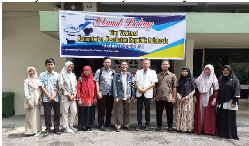
Figure 3. Ministry of Health Visitation Team

The progress of the establishment process can be seen online at the website. The next stage is the visitation conducted by the Ministry of Health team. This visitation was carried out to verify documents and the readiness of human resources, IPFK facilities and infrastructure to test and calibrate medical devices. The visit took the form of presentations, HR interviews, HR competency tests, and verification of infrastructure and quality documents. The visitation activity was carried out for 1 day at the IPFK Laboratory as shown in Figure 3.