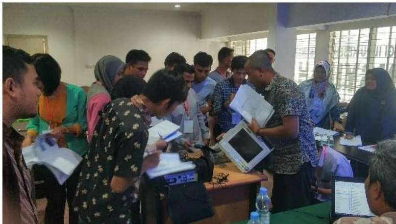
Figure 1. Training on Testing and Calibrating Medical Devices with BPFK Jakarta

Next, the preparation of quality documents consisting of quality guidelines, quality procedures, worksheets and work methods is carried out as determined by the Director General, according to the type of Testing and/or Calibration. Quality guidelines and quality procedures are developed referring to the SNI ISO IEC 17025:2017 standard which is adapted to IPFK's internal policies. The working method was developed based on standards from the Ministry of Health, while the worksheet was developed referring to the work method based on guidance from BPFK Jakarta.