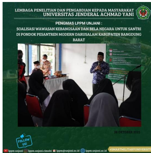
Figure 1. Education and Socialization