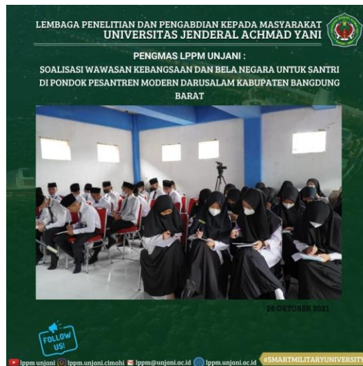
Figure 2. Focus Group Discussion