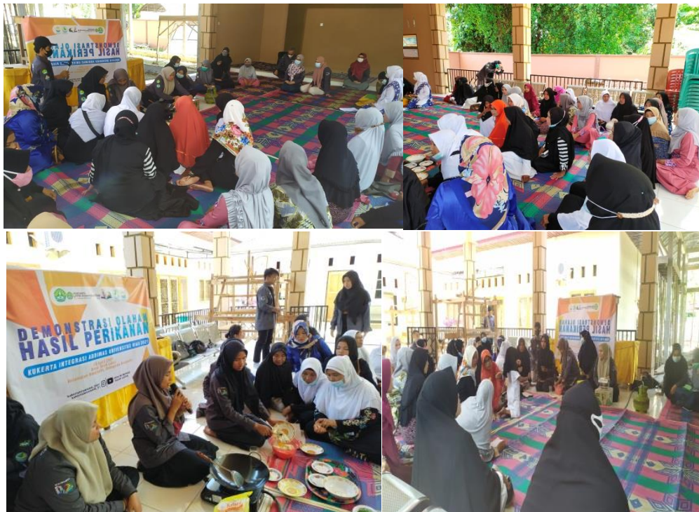
Figure 2. Extension activities on processing fish-based snacks to the community in Teluk Latak Village, Bengkalis