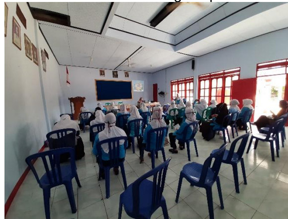
Figure 2. Early detection training activities