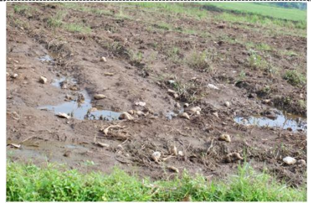
Figure 6. Sweet Potatoes That Are Not Grown by Farmers