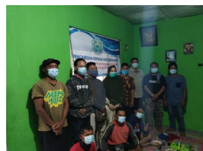
Figure 4. PKM activities