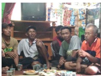
Figure 3. FGD Activities