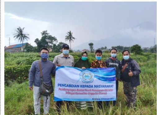
Figure 2. Activity Documentation (PKM Team)