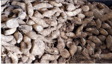
Figure 5. Low Quality Sweet Potatoes (kulanans/boleng)