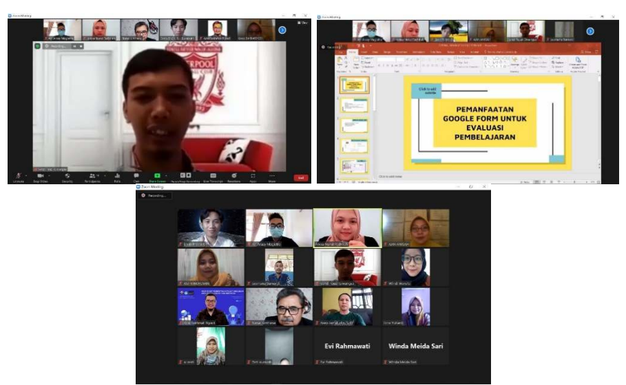
Figure 1. Training Implementation