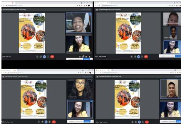
Figure 4. Online Promotion with Ornamental Fish Lover Groups/Communities