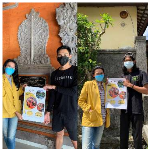
Figure 6. Direct Promotion with Local Communities and Youth Representatives from Banjar Tingkadbatu, Jehem Village