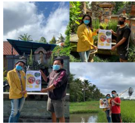
Figure 5. Direct Promotion with Representatives of Ornamental Fish Lovers Groups/Communities, Local Communities, and Youth Representatives from Banjar Tingkadbatu, Jehem Village