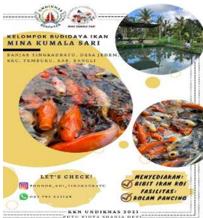
Figure 2. Promotional posters