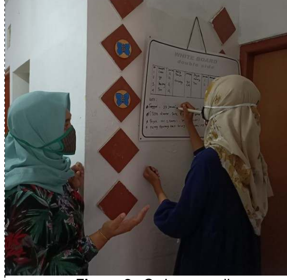
Figure 2. Order recording