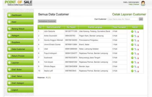
Figure 6. Display of All Customer Data