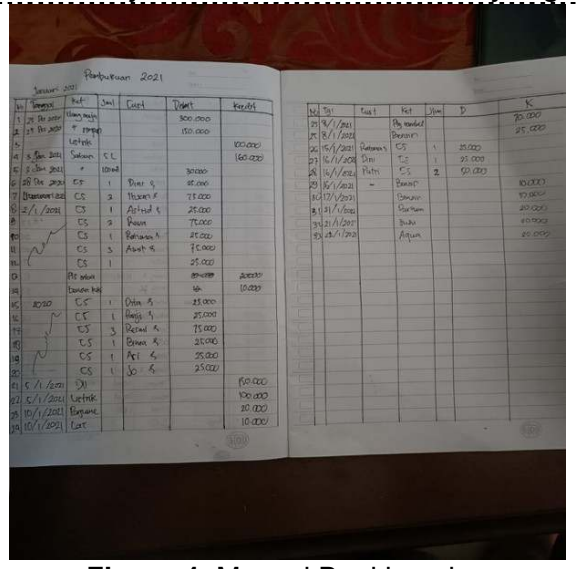
Figure 1. Manual Bookkeeping

Community Service at the UMKM 'Nyong Group' Yogyakarta.