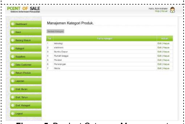
Figure 5. Product Category Management Display