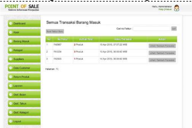
Figure 3. Report on the Amount of Best Selling Figure 4. Display of All Incoming Goods Transactions