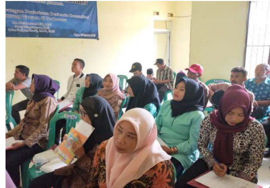
Figure 2. Exposure Material