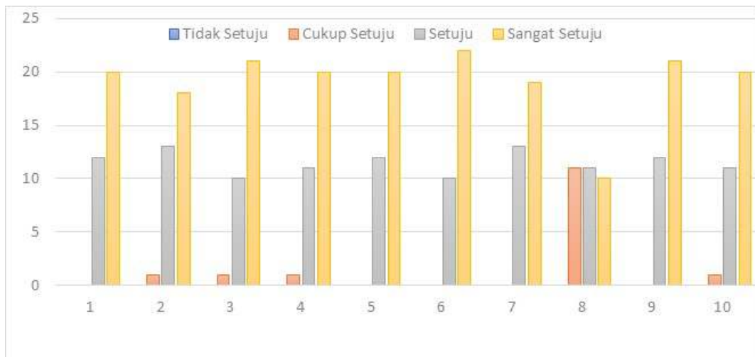
Figure 3. Evaluation Activities