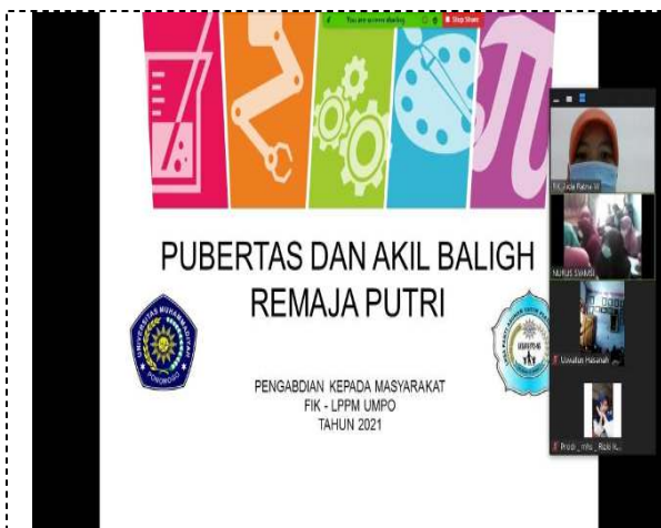
Figure 1. Presentation of Material 1