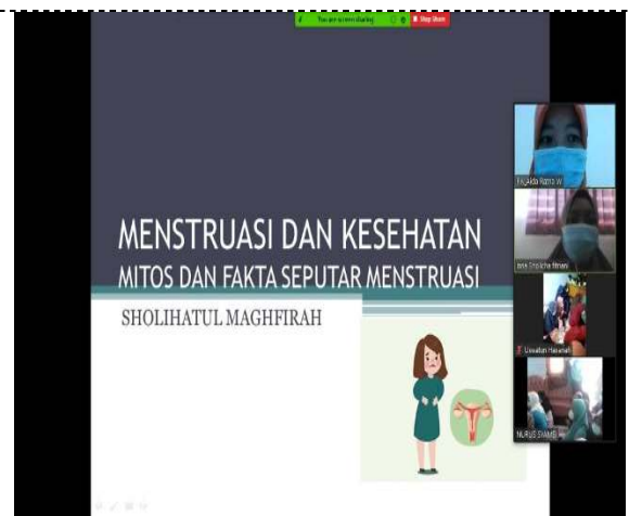
Figure 2. Presentation of Material 2