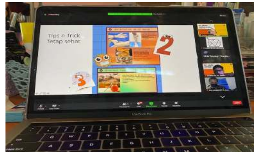
Figure 2. Handbook Socialization Event Documentation