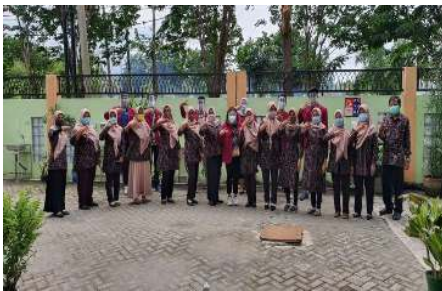
Figure 1. The Grand Convalescence Committee at Sambikerep II State Elementary School