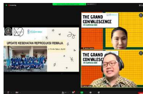
Figure 4. Webinar Event "Education Readiness for the New Normal Era"