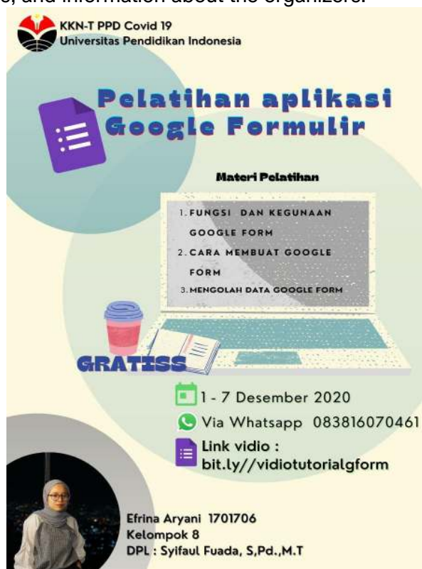
Figure 1. Training activity pamphlet Google form

Before the activity was carried out, activity pamphlets were prepared under the guidance of the lecturer (Figure 1). Then, this pamphlet was distributed to a WhatsApp group containing teachers from SDN Nusa Indah (Figure 2a). To maximize the number of participants, the organizers made an invitation through a private chat on WhatsApp in addition to the large group of SDN Nusa Indah (Figure 2b). The pamphlet was created using the Canva application that contains important information such as the event's name, the time and place of the event, online training materials, and information about the organizers.