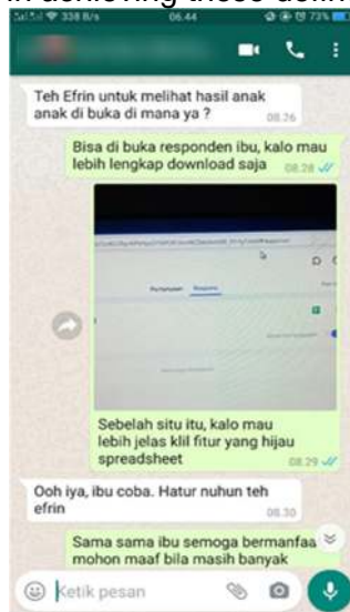
Figure 3. Discussion screenshots with participants when KulwApp lasted

done face-to-face or face-to-face. This training on making questions with Google forms is one of the efforts to facilitate teachers in achieving these defined parameters.