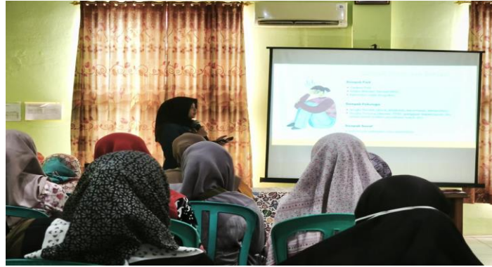
FIGURE 1. Delivery of Educational Material on Early Marriage and Sexual

The evaluation of the activity was conducted using pre-test and post-test assessments involving 20 participants, consisting of parents with children ranging from elementary school to adolescence who attended the educational session. The results showed an improvement in participants' knowledge and understanding regarding the prevention of sexual violence and early marriage.